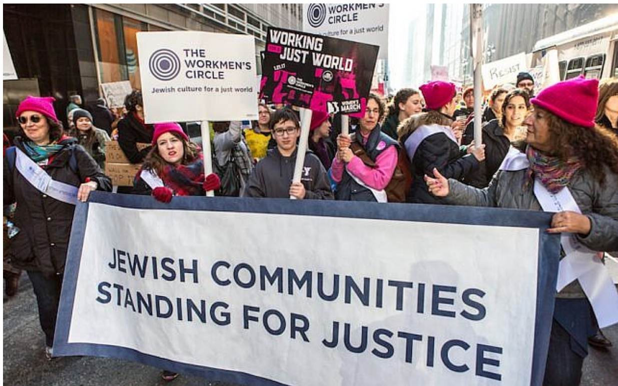
Participants in the New York Women's March marching with the Workmen's Circle, Jan 21, 2017.

The event, which last year took place in cities around the world the day after Trump's inauguration, is set to kick off Saturday